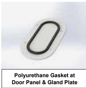
Polyurethane Gasket at Door Panel & Gland Plate