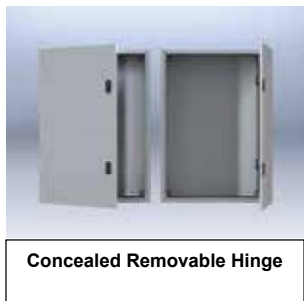
Concealed Removable Hinge