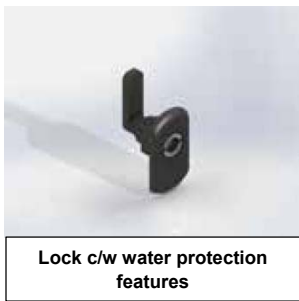
Lock c/w water protection features