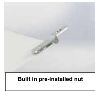
Built in pre-installed nut